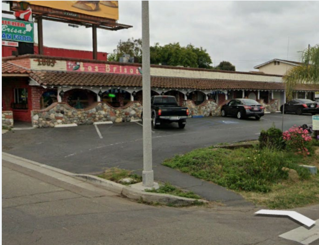
Current Conditions: South of intersection with W. Aviation Rd.